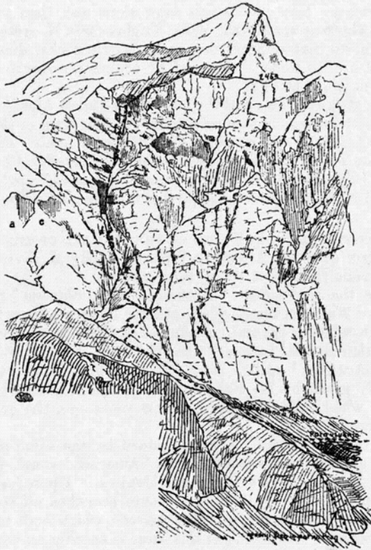
N. FACE OF TRIGLAV WITH 'SLOVENE' ROUTE.

called a chimney—access to which is difficult. Then follow about 30 ft. of perpendicular rock. Above this you come out upon the 'Kugy' ledge close to the permanent snow around the Triglav glacier. From this point onward you have the choice of several well-known routes— either to follow the usual route to the left over